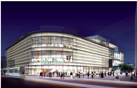
Visualisation of the proposed John Lewis Partnership store in the PSDA

The PSDA covers a 42 acre site in the centre of Liverpool spanning the area between the main shopping street (Church Street) to the docks in the south. The site was previously mainly at grade car parks and will soon be a vibrant mixture of retail units, restaurants, leisure facilities, and a new hotel. It will be home to two new department stores, a new John Lewis Partnership and Debenhams. For residents of the city there will also be new residential units and the reworking of the park.