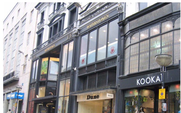
Retail land uses in Bold Street

Intelligent Space worked in partnership with Turley Associates on the masterplan for the Rope Walks area of Liverpool. Intelligent Space were brought in to assess how people currently move around the site and to review how changes to the PSDA, which lies adjacent to Rope Walks, is likely to affect the area. This is to show how the masterplan can maximise linkages between the proposed retail developments and the Rope Walks site.