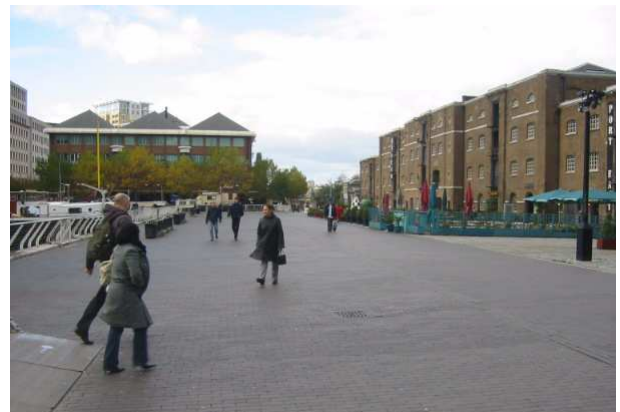
West India Quay

Intelligent Space carried out a pedestrian observation study around West India Quay station on the Docklands Light Railway. The study was commissioned in order to inform the landscape strategy at an early stage by identifying how pedestrians are currently using the area and providing conclusions about potential public space enhancements. In conjunction with the observation study, Intelligent Space carried out a public space audit to show the potentials of the site and highlight key barriers to pedestrian movement.