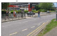
Observed informal crossings