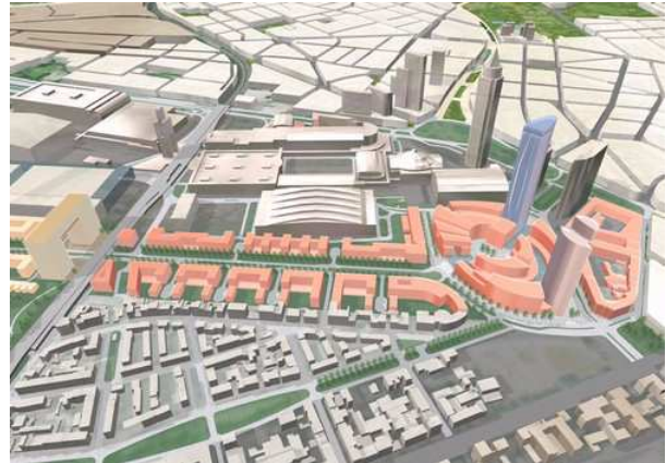
Computer model of masterplan by Vivico

Vivico commissioned Intelligent Space to provide a pedestrian strategy report evaluating four design options for the public space of the Boulevard, in order to identify their advantages and disadvantages. For this evaluation, visibility, accessibility and pedestrian capacity were analysed using computer modelling tools. Comparative data about public space design were taken from a sample of existing European Boulevards. These case studies were used to identify best practice examples from existing streets of a similar scale.